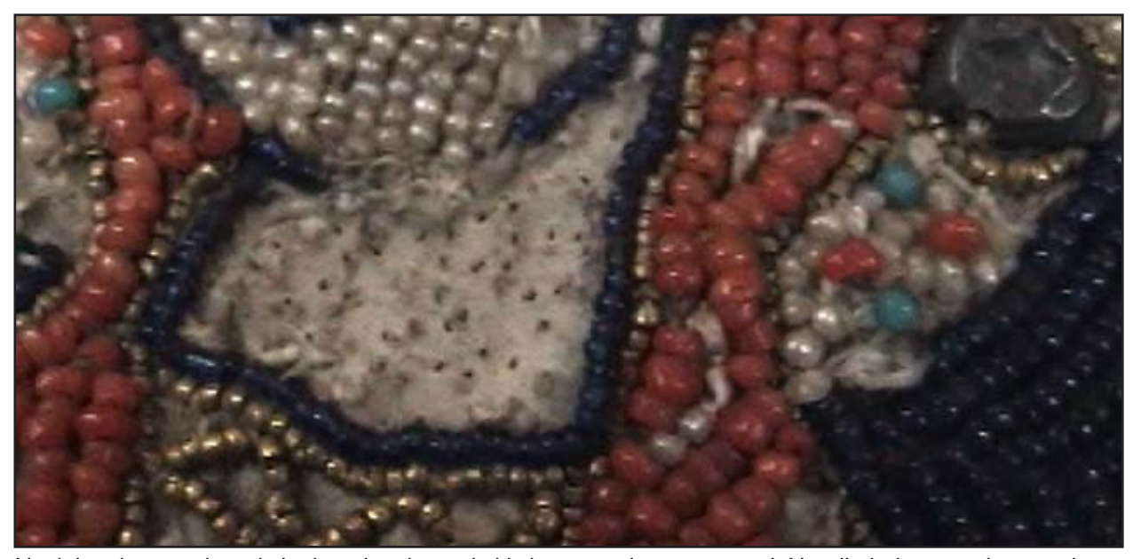
Neck has been stripped cleabn, showing only it's bare parchment ground. Needle holes are elongated, not round. Could this be from fine flattened steel needles? As today they would need something flexible.