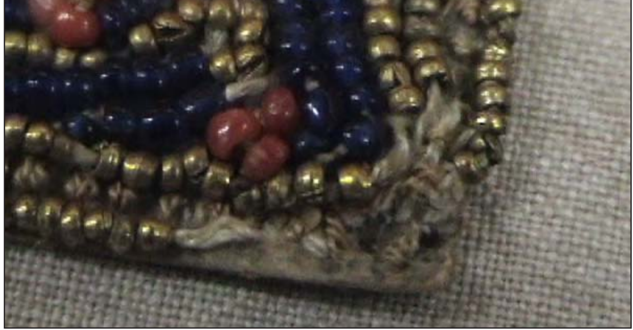
Gold beads were formed of wire and crimped shut, proabably with some sort of shaping plier as they are all pretty consistant in shape. Cut seams from the wire coiling it was prob. cut from are clear here.