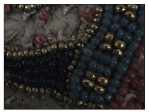
Dark ink underdrawng showing where the bezants (that were removed) were placed.