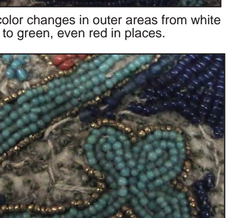
Running stitched holding the beads were removed to scavenge pearls, leaving the couching stiches.