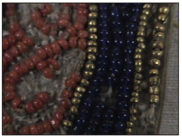
Thread color changes in outer areas from white (natural) to green, even red in select places.