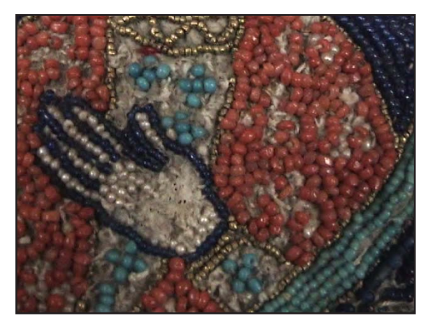
Look how completely this coral field was stripped of it's white fleur de lys with a few thread snips to the running stiches that run through the pearls.