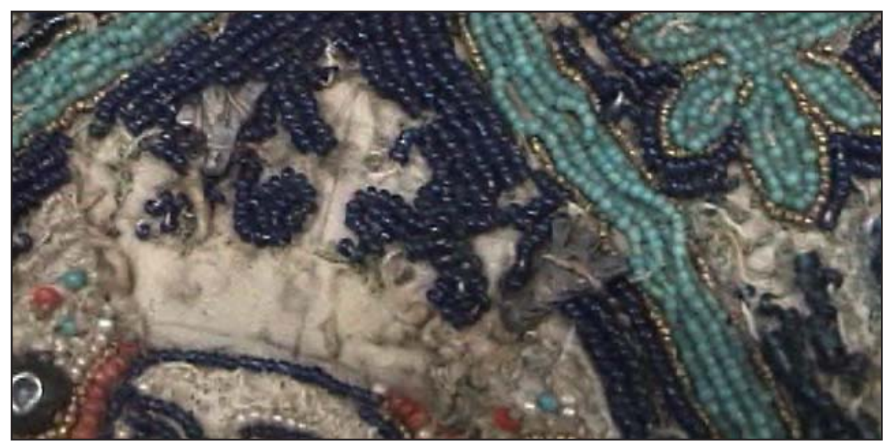
Dark underdrawing in ink, metal traced in. Notice center guideline. Silver (pewter?) crown removed, only small sewn bits remain. was traced on parchement, beads applied around lines and crown sewn over top.