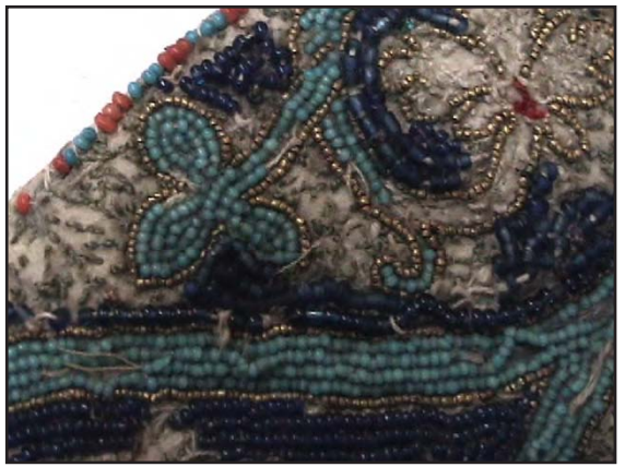
Thread color changes in outer areas from white (natural) to green, even red in places.