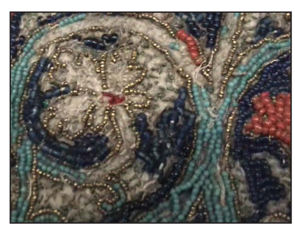
Gold beads were left while pearls were looted.