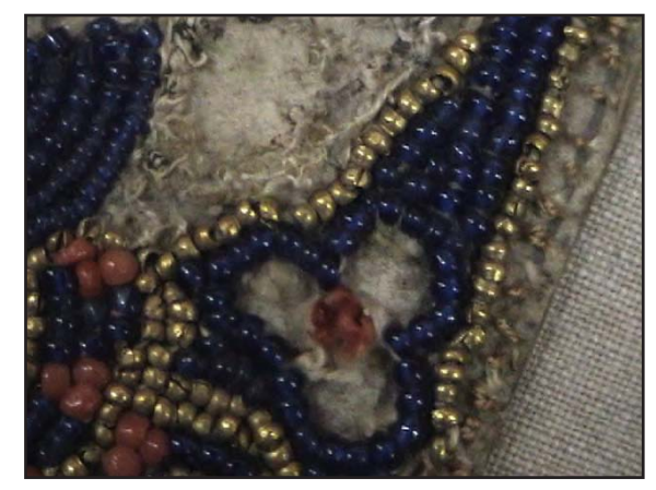
Couching loops are all that remain of the pearls that once filled in these areas.